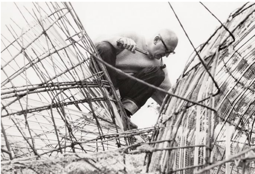
Antti Lovag at the Maison Bernard construction site

On the fringes of the architecture of their time, they were pioneers of an innovative movement that emphasized environmental considerations, seeking to integrate the dwelling into its natural setting. They upheld an evolutive, intuitive approach to architecture, adapted to the needs of the occupants. In 1969 Lovag began his first residential project in Tourrettes-sur-Loup, in southeastern France. Alternatively called Maison du Rouréou or Maison Gaudet, the structure was not fully completed until 30 years later. In parallel, Lovag started the construction of Maison Bernard, and pursued his reflections on the dwelling and well-being by building Palais Bulle, also in cooperation with his friend Pierre Bernard. Between 1974 and 1979 he built the CERGA geodynamic and astronomical research center on the Calern Plateau in Provence, followed in the late 1980s by Villa Roux in Fontaines-sur-Saône, near Lyon. In 2001 the architect moved into a three-quarter scale model that he had built for Maison du Rouréou in the heart of the forest in Tourrettes-sur-Loup. He lived there until his death in 2014.